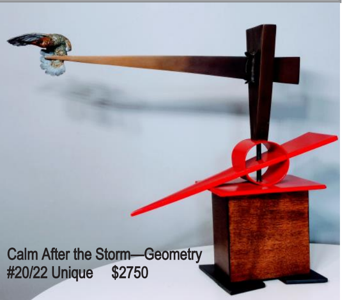
Calm After the Storm—Geometry #20/22 Unique $2750