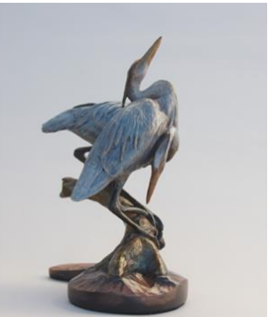
Focus (L) $1200 Unity $1750 Edition of 22