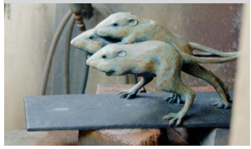
Order The Rat Race today at $3,250, editions 6-10/22 only 22"x10"x7 50% down, balance at delivery, estimated September 2015.

The Rat Race is complete and off to the foundry for casting, release date is late June, 2015. The first five are sold.