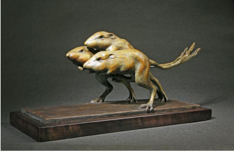
22x9x10 Edition of 22 Bronze on Walnut

Using the sculptural kangaroo rat (bullet shaped heads, long legs and tails) as subjects, each is jockeying for position. Who's the best? Who's the hungriest? And who's the most focused?