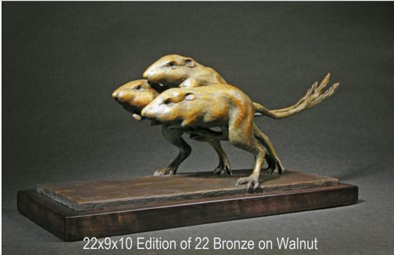
22x9x10 Edition of 22 Bronze on Walnut

Using the sculptural desert kangaroo rat as subjects, each is jockeying for position. Who's the best? Who's the hungriest? And who's the most focused?