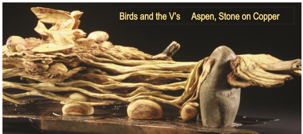
Birds and the V's Aspen, Stone on Copper