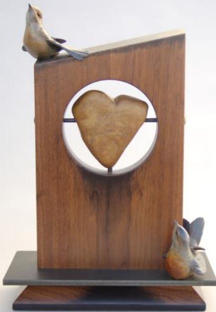
Bronze, Heart Stone on Walnut and Steel